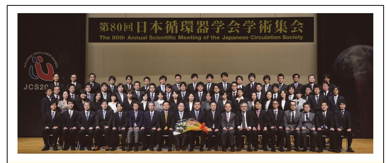
Figure 5. Commemorative photograph of the doctors and staff of the Department of Cardiovascular Medicine, Tohoku University.

MRI, CT, and SPECT to predict CRT responders; the characteristics of CRT responders with narrow QRS on ECG; and the effects of CRT on patients with AF.